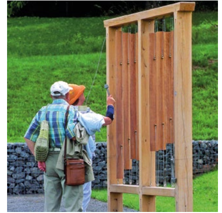
Order No. 10.53102 Tubular Dendrophone - double field