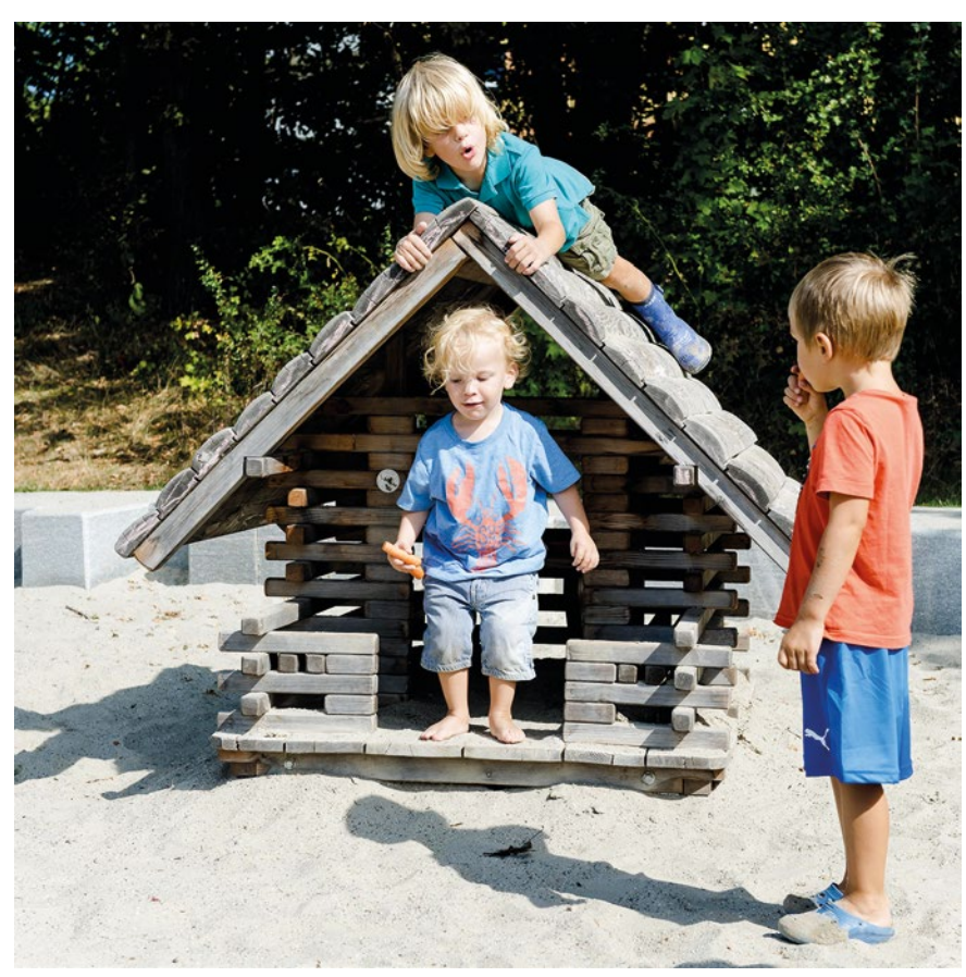
Smallest Playing House