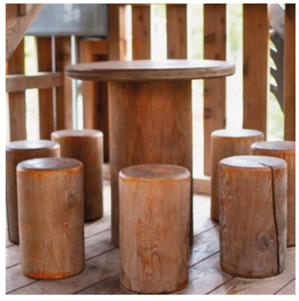
Order No. 4.35050 Toddler's Table with 8 Stools, Table as a special version