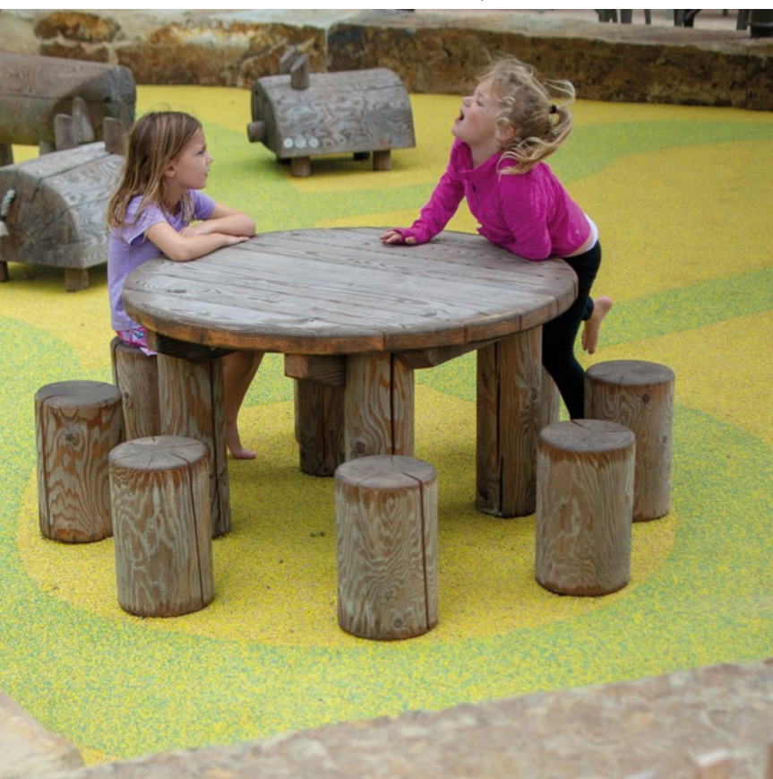
Order No. 4.35050 Toddler's Table with 8 Stools

Play Table Trunk Seat Toddler's Table with 8 Stools