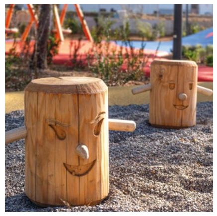
Special version, Order No. 4.24200 Trunk Seat