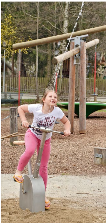
Order No. 5.18130 Pedal Pump with Spray Head in Handlebar