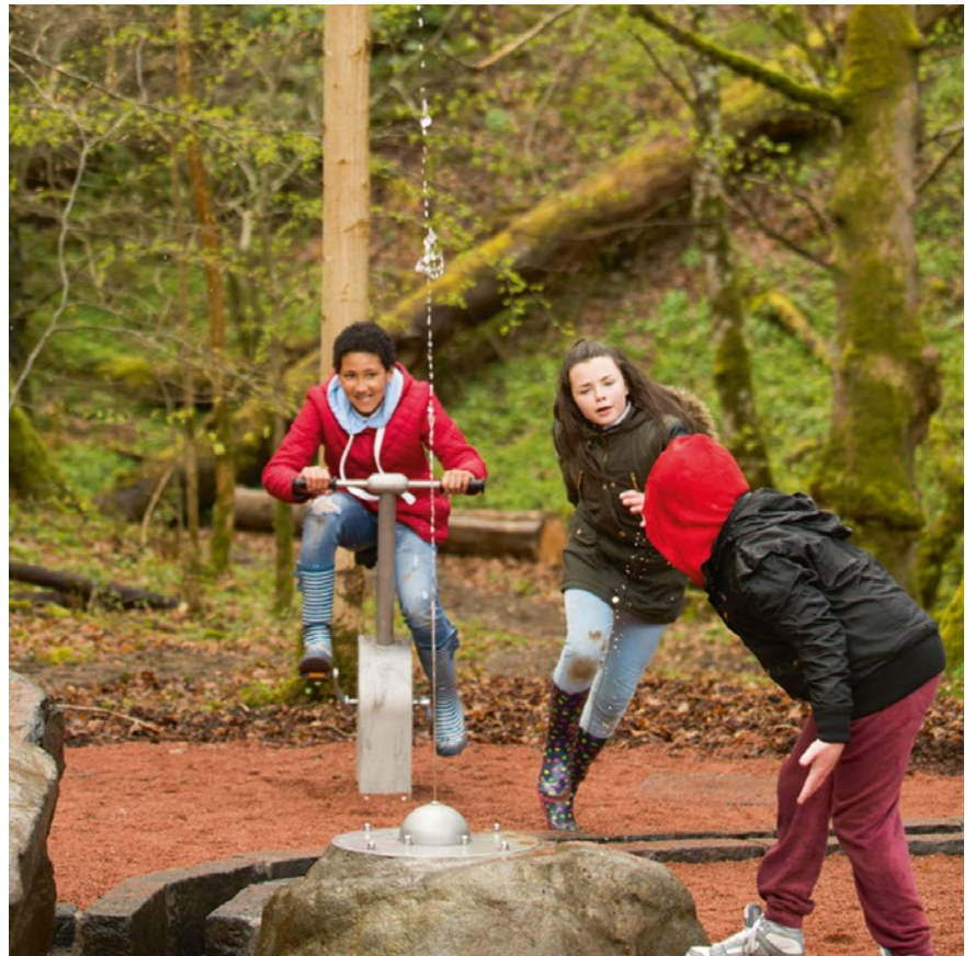
Order No. 5.18230 Pedal Pump for external Spray Head