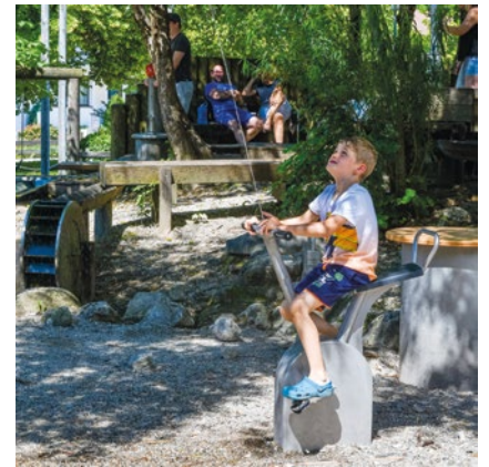
Order No. 5.18130 Pedal Pump with Spray Head in Handlebar