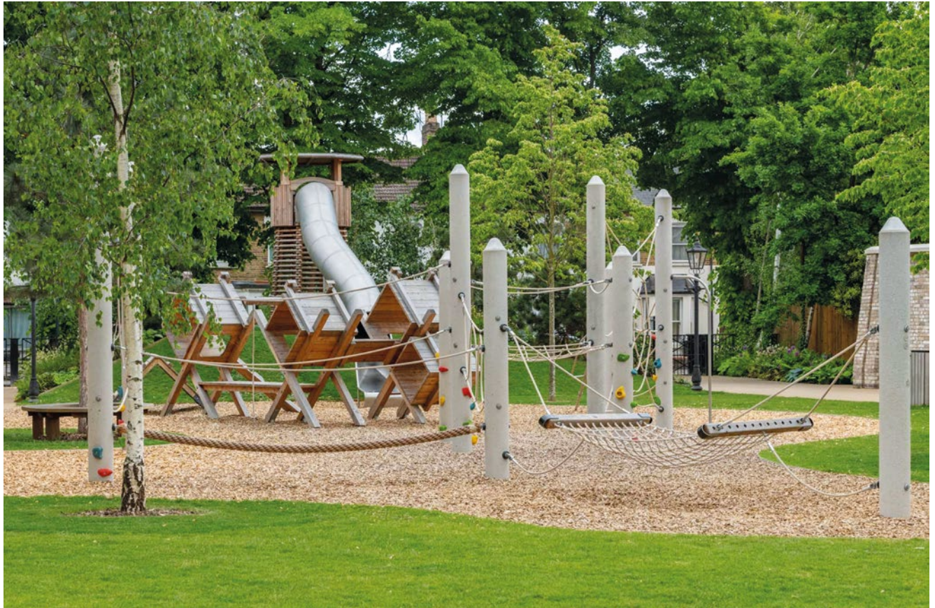
The standard colour of ropes red