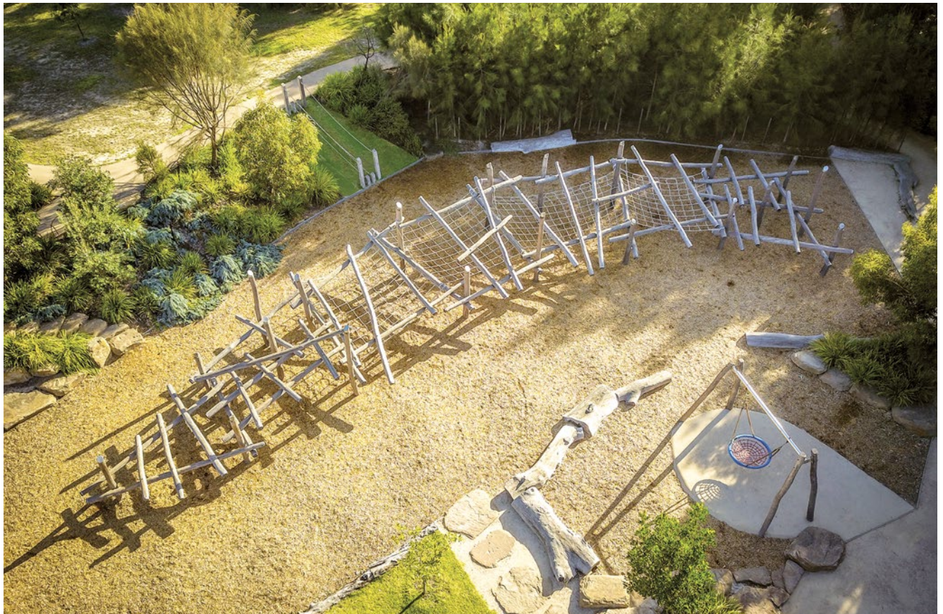
Special version with rings and caps, Photo © Tristan Filippone