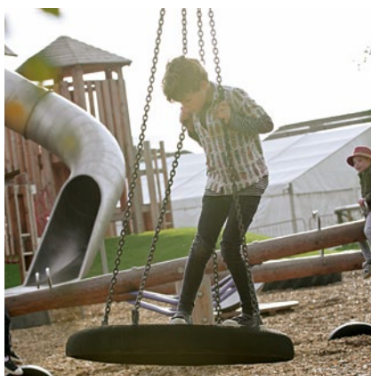
Tractor Tyre Swing