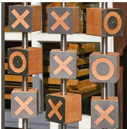
Tic Tac Toe