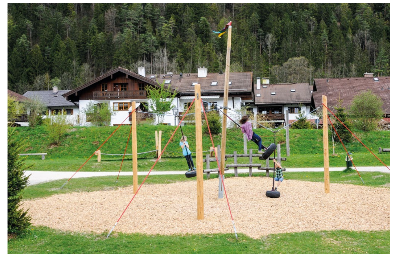
The photo shows different tensioning ropes.